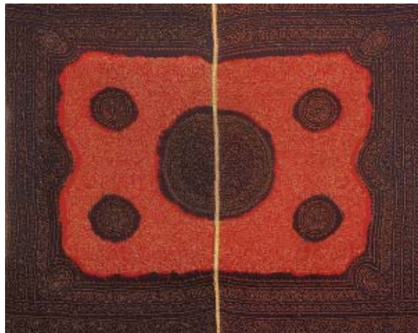
Fig. 6 – Bandanna design, early twentieth century

There were other cloths in the order book that were noted by their place of origin: Kasimbazar, Patna, Calcutta, Orissa, Charpoore. The widespread use of such words shows how popular Indian textiles had become in different parts of the world.