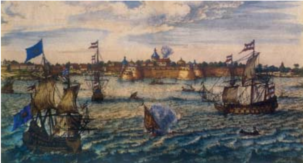
Fig. 1 – Trading ships on the port of Surat in the seventeenth century

Surat in Gujarat on the west coast of India was one of the most important ports of the Indian Ocean trade. Dutch and English trading ships began using the port from the early seventeenth century. Its importance declined in the eighteenth century.