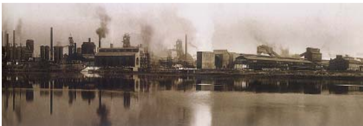
Fig. 14 – The Tata Iron and Steel factory on the banks of the river Subarnarekha, 1940

Slag heaps – The waste left when smelting metal