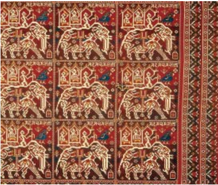
Fig. 2 – Patola weave, mid-nineteenth century

Let us first look at textile production.