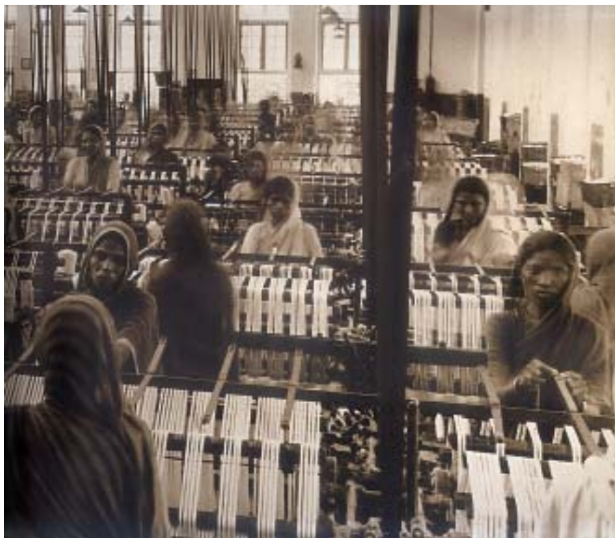
Fig. 10 – Workers in a cotton factory, circa 1900, photograph by Raja Deen Dayal

The first cotton mill in India was set up as a spinning mill in Bombay in 1854. From the early nineteenth century, Bombay had grown as an important port for the export of raw cotton from India to England and China. It was close to the vast black soil tract of western India where cotton was grown. When the cotton textile mills came up they could get supplies of raw material with ease.