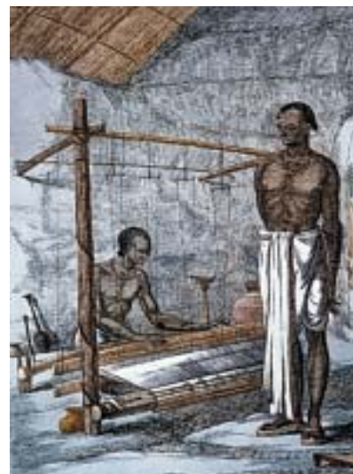
Fig. 9 – A tanti weaver of Bengal, painted by the Belgian painter Solvyns in the 1790s

By the beginning of the nineteenth century, English-made cotton textiles successfully ousted Indian goods from their traditional markets in Africa, America and Europe. Thousands of weavers in India were now thrown out of employment. Bengal weavers were the worst hit. English and European companies stopped buying Indian goods and their agents no longer gave out