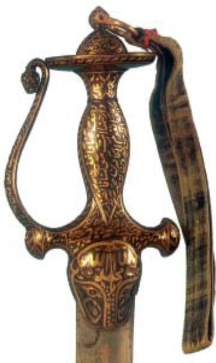
Fig. 11 – Tipu's sword made in the late eighteenth century

Smelting – The process of obtaining a metal from rock (or soil) by heating it to a very high temperature, or of melting objects made from metal in order to use the metal to make something new