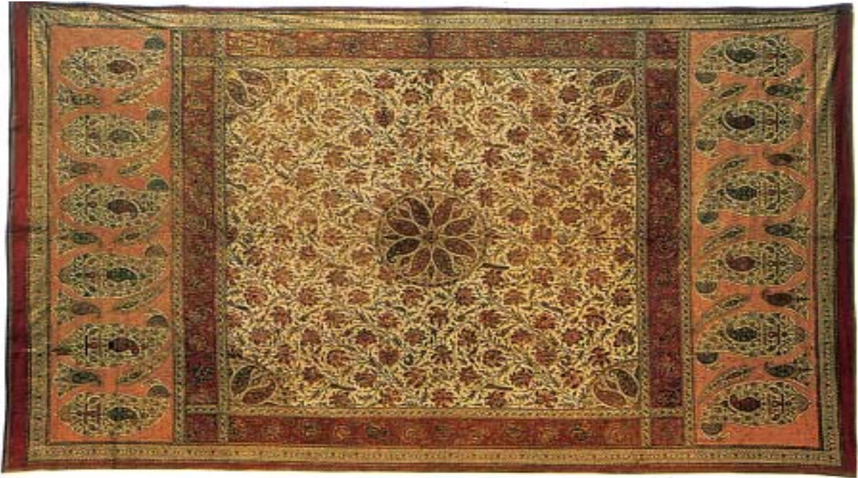
Fig. 5 – Printed design on fine cloth (chintz) produced in Masulipatnam, Andhra Pradesh, mid-nineteenth century

This is a fine example of the type of chintz produced for export to Iran and Europe.