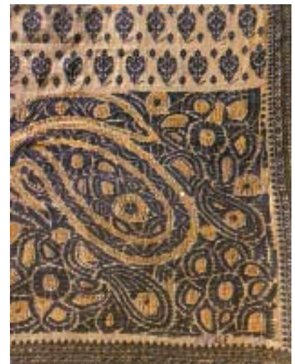
Fig. 4 – Jamdani weave, early twentieth century

Notice how each item in the order book was carefully priced in London. These orders had to be placed two years in advance because this was the time required to send orders to India, get the specific cloths woven and shipped to Britain. Once the cloth pieces arrived in London they were put up for auction and sold.