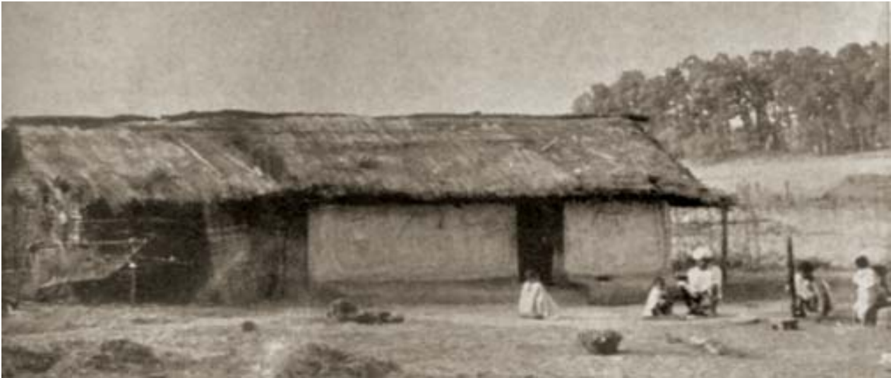
Fig. 13 – A village in Central India where the Agarias – a community of iron smelters – lived.

Some communities like the Agarias specialised in the craft of iron smelting. In the late nineteenth century a series of famines devastated the dry tracts of India. In Central India, many of the Agaria iron smelters stopped work, deserted their villages and migrated, looking for some other work to survive the hard times. A large number of them never worked their furnaces again.